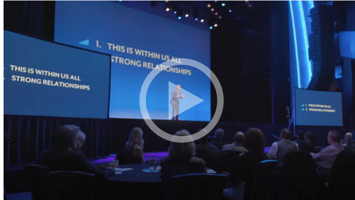
Speaker Reel: Watch