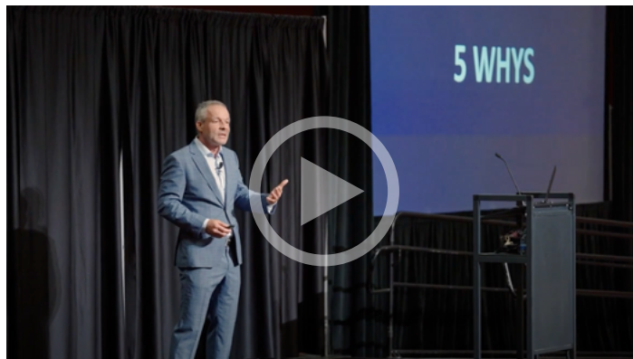
Full Keynote: LWHRA Symposium - Seattle Watch